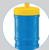
Ergonomic drive with simple handling